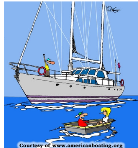
"Tell him our 'real' boat is in the shop."