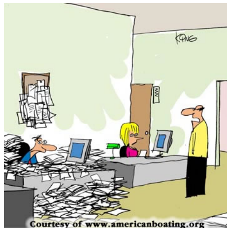
"It's come to my attention that one of you got behind on your work because of looking at boats on the Internet."