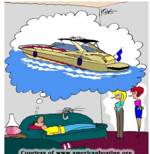
"How sweet, he's smiling. He must be dreaming about me."