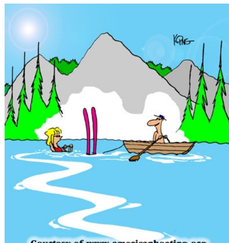
"I think we'd have more fun if we invested in a real boat."