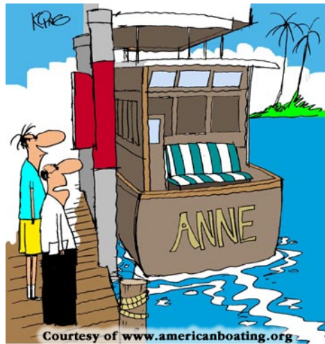
"I'd love to sell you this boat...however, I doubt the bank will allow you to finance it for 3,000 months."